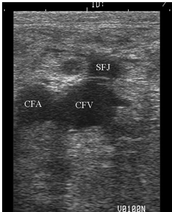
Fig. 3. Transverse view of common femoral vein and artery in the right groin: 'Mickey Mouse' view; CFA, common femoral artery; CFV, common femoral vein; SFJ, sapheno-femoral junction.

known as the 'saphenous eye'. Test every few centimetres for compressibility and reflux.